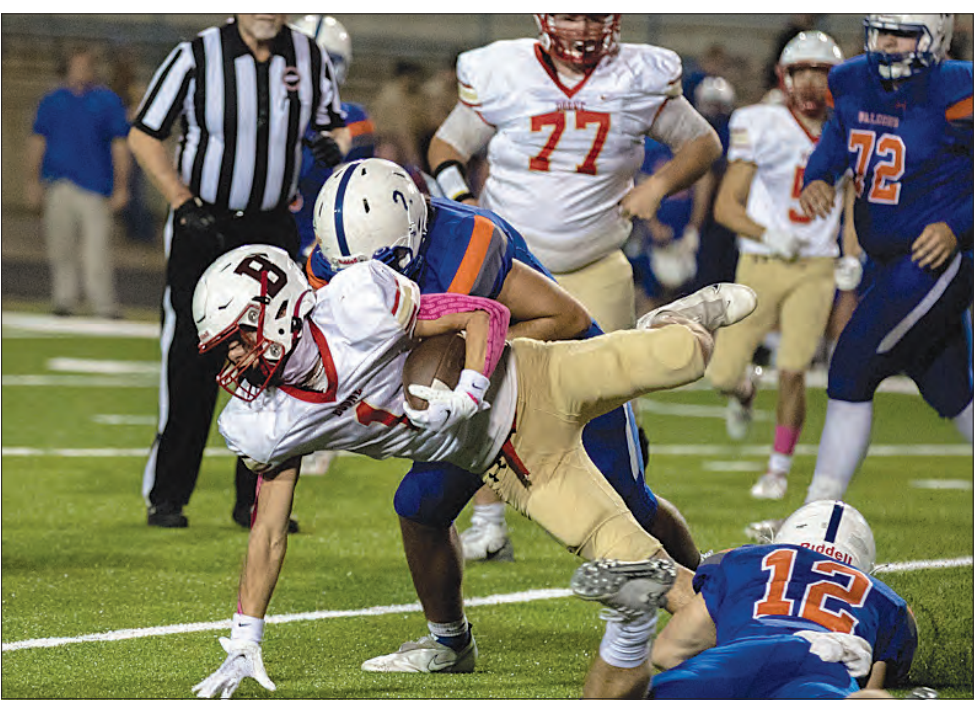
Blair paced Boone with nearly 200 yards rushing and a pair of touchdowns.