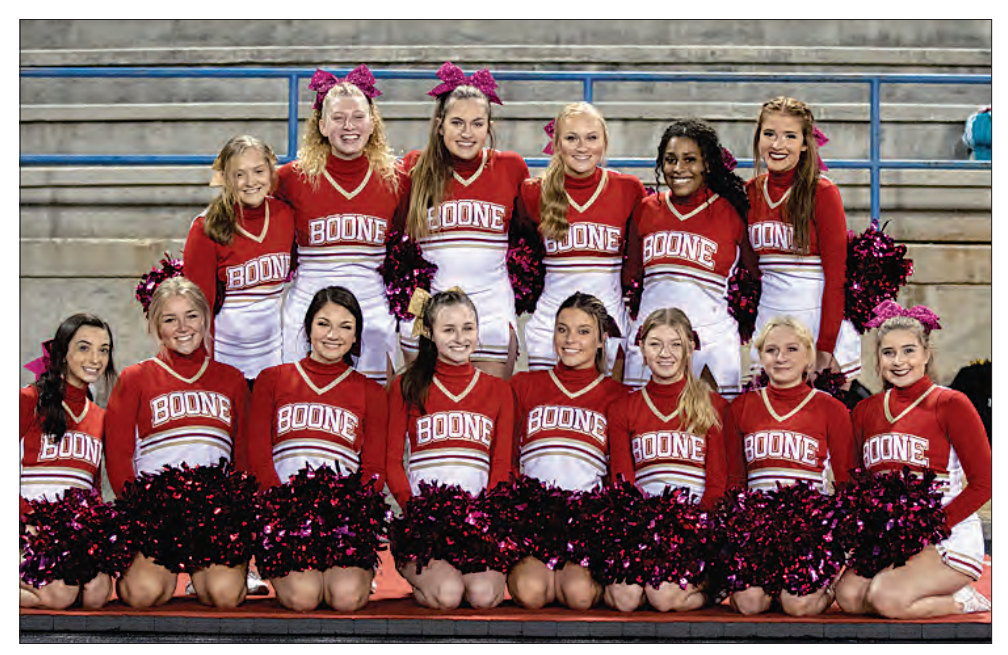
The Daniel Boone cheerleaders get ready to cheer on the Trailblazers during a key game against Volunteer last Friday night.