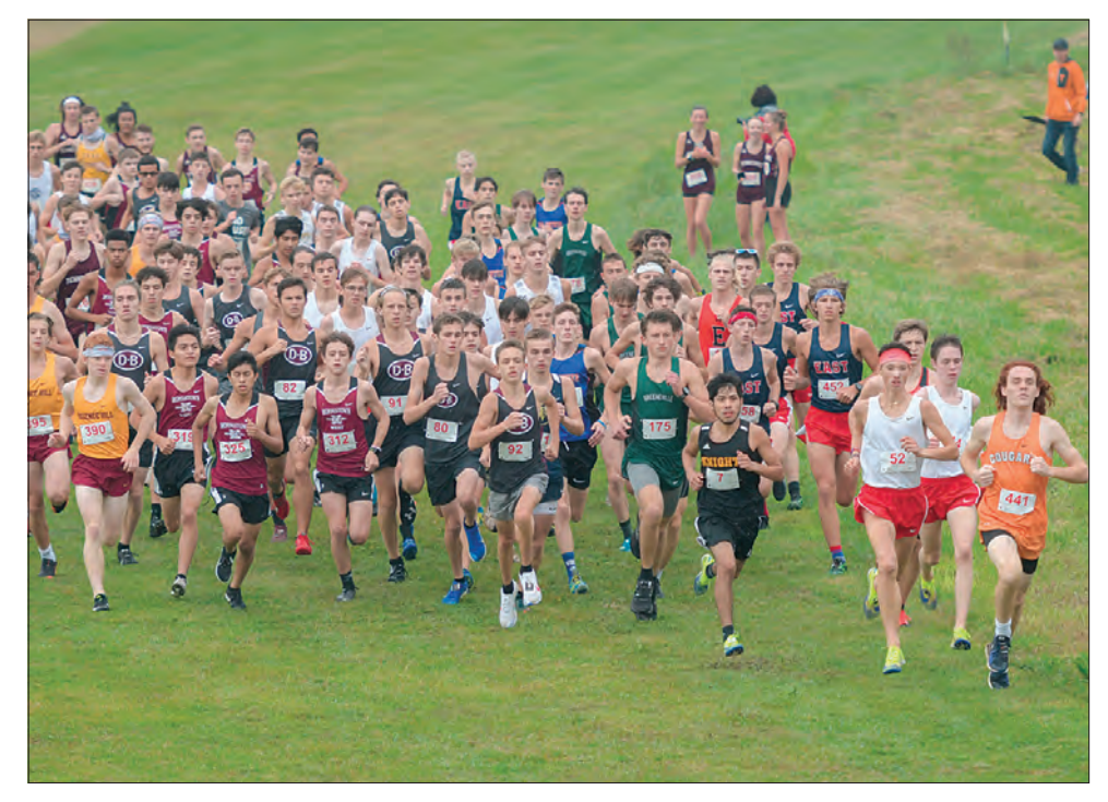
Runners take off from the starting line during the boys race at the Trailblazer Invitational, which was held last Saturday morning at Daniel Boone High School. The Daniel Boone boys and girls swept the team titles for the first time in the 48year history of the event.