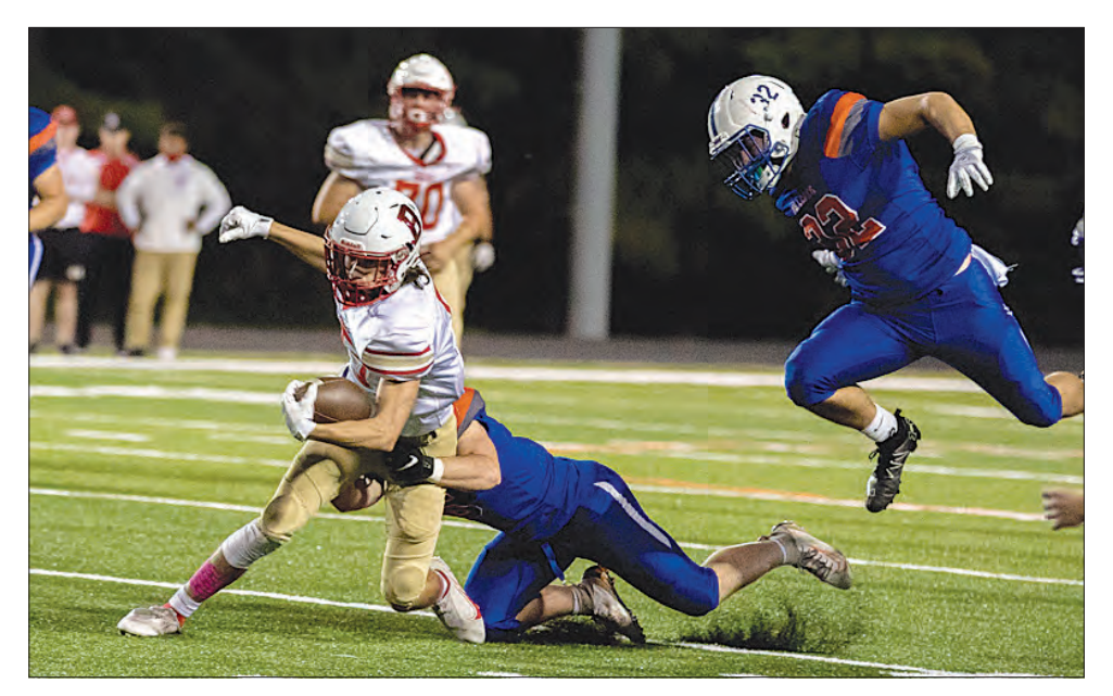
A Trailblazer tries to escape the grasp of a Volunteer tackler.