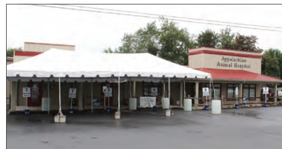
Covered, curbside parking spaces for your comfort.

We practice advanced COVID protocols when you visit with your pet. We make the experience less stressful and safer for you and your pet.