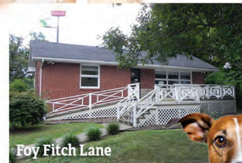
Foy Fitch Lane